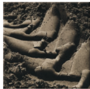
Dirt & Contamination